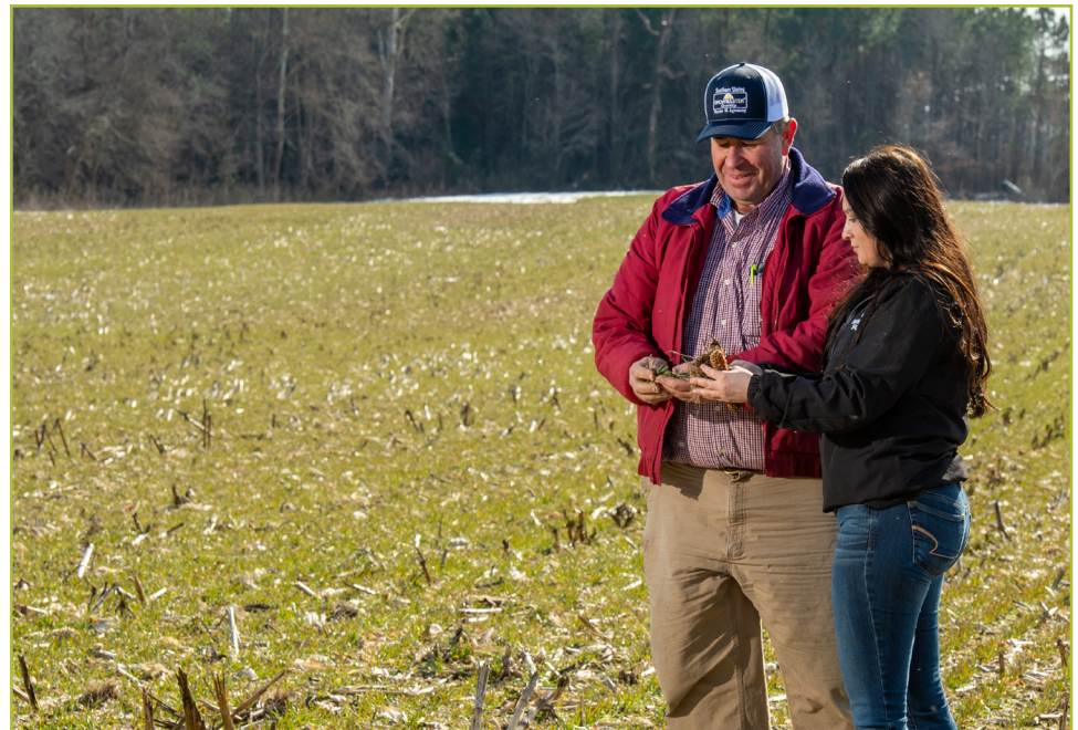
FERTILIZER SALES REPRESENTATIVE