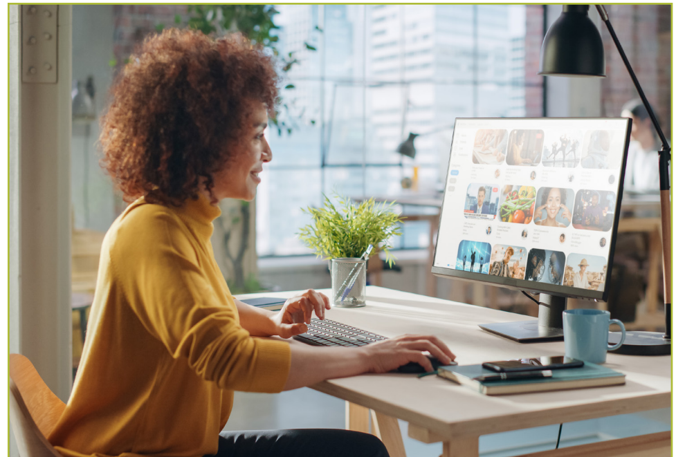
SOCIAL MEDIA SPECIALIST