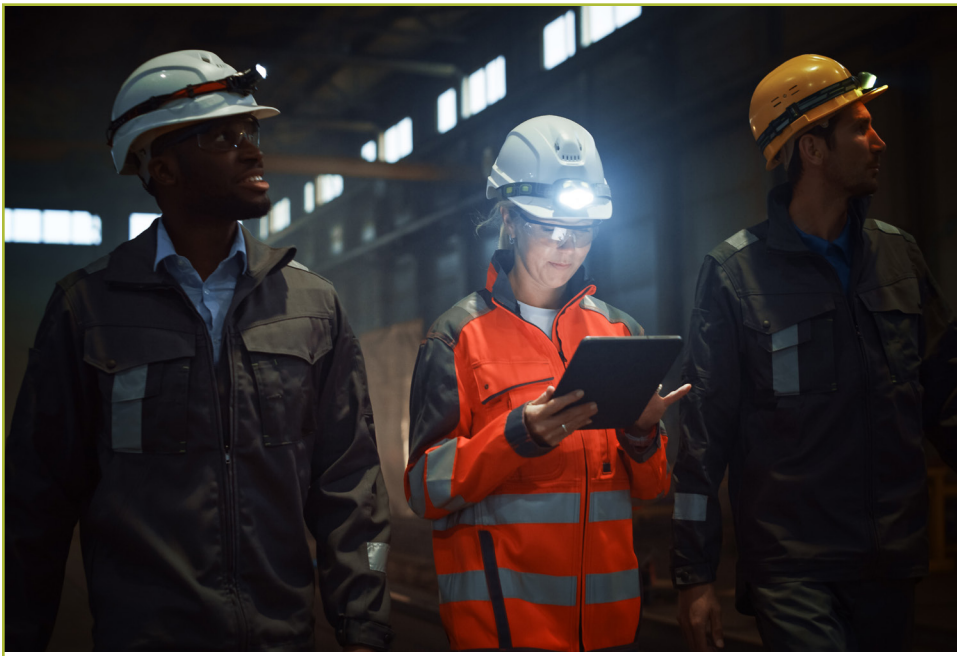
PROCESS OPERATING TECHNICIAN