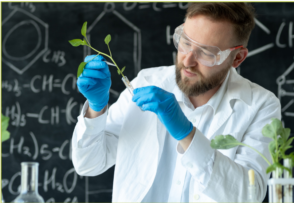
FERTILIZER FORMULATION CHEMIST