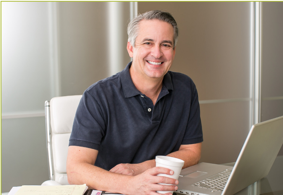
BUSINESS OPERATIONS MANAGER