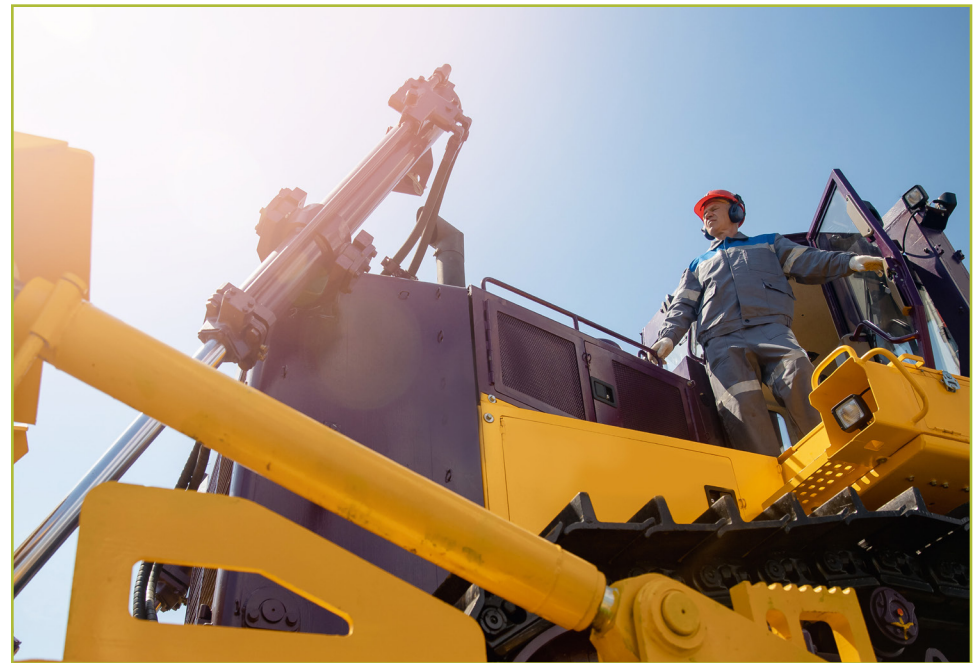
HEAVY EQUIPMENT OPERATOR