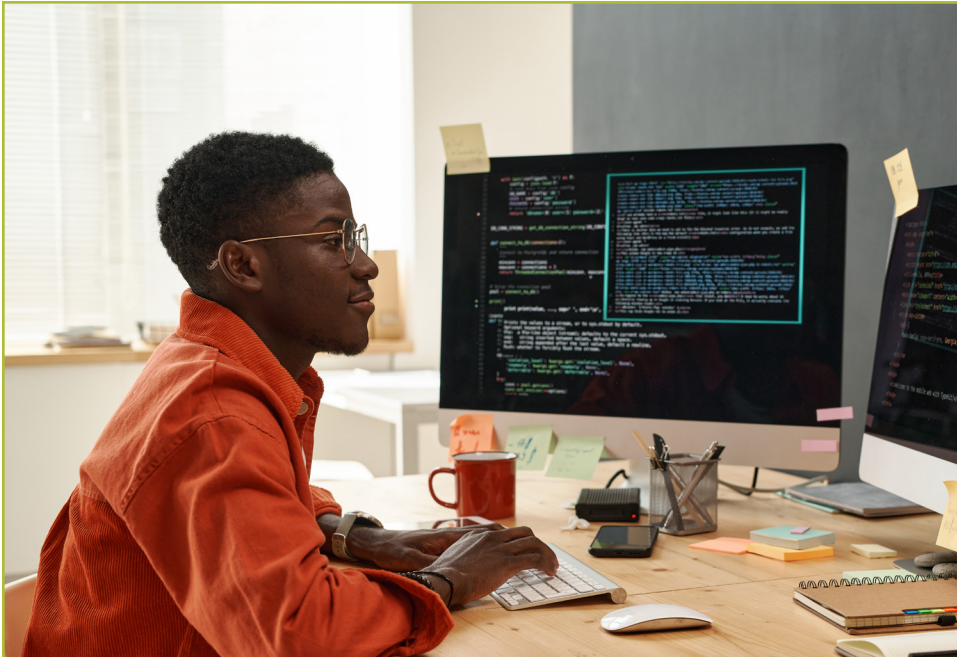
IT SUPPORT SPECIALIST