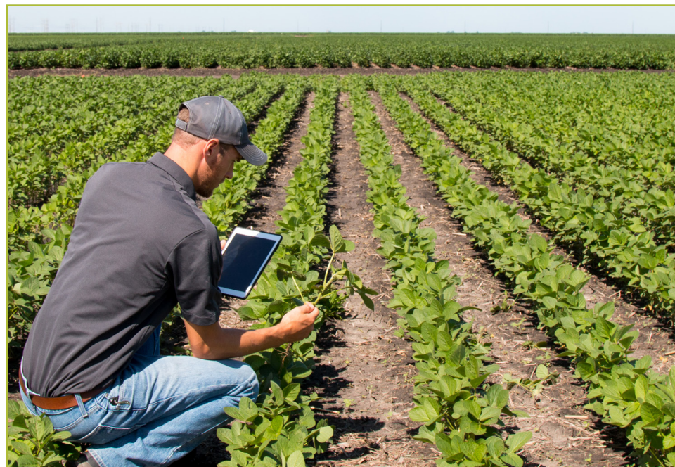
PEST CONTROL ADVISER